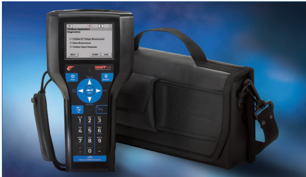
The 475 Field Communicator, with its handy carrying case, provides a single tool for configuring and diagnosing HART and FOUNDATION fieldbus devices.