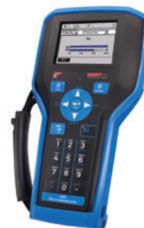
The protective rubber boot provides added protection in the field.

The 475 Field Communicator is designed, manufactured, and tested to very demanding specifications. It is ready to go wherever you need to go to get the job done.