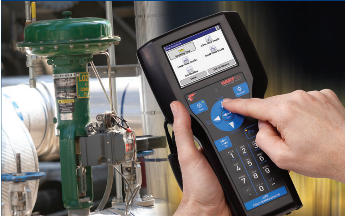
Gain advanced diagnostics in the field through ValveLink Mobile and enhanced graphics.